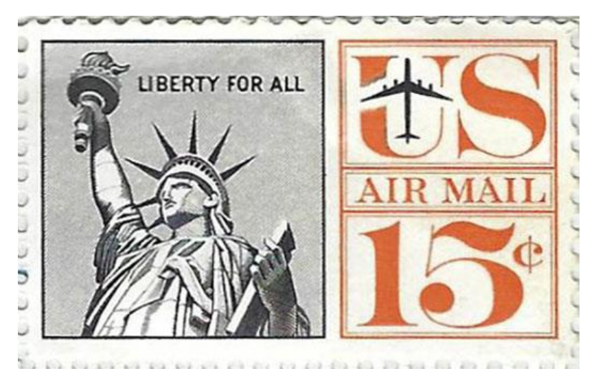
The stamp on the envelope for the second letter of 2 December 1963 (below)

[ PS on back of envelope ] 11·45 am London time: I've got over it. no scars. я тебя лублю – that is why all is so well . I look forward 'ОЧЕНЬ" to our "free" ХОЛИДЭЙ ТУГЕЗЗЕР, Э ЛОУН.<sup>88</sup>