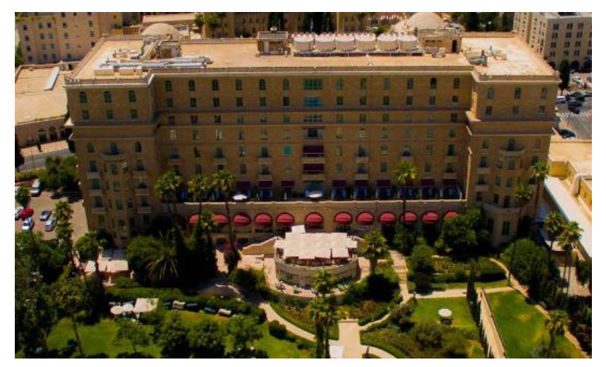
King David Hotel, Jerusalem