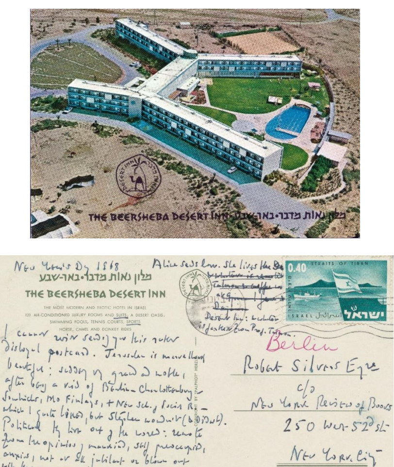
The stamp and some of IB's deletions obscure parts of the original conclusion of the PS: 'De[sert Inn] & whatever is remotest [from Prof.] Talmon & coffee [...] at 9 pm. I f[...] Dep[...]'.