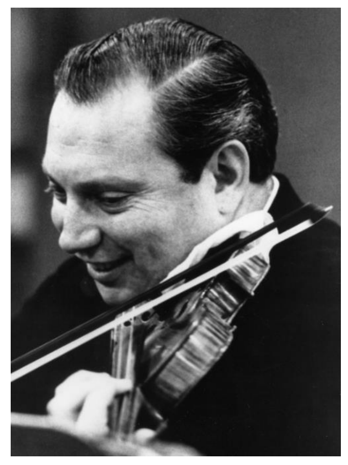
Isaac Stern, 1963