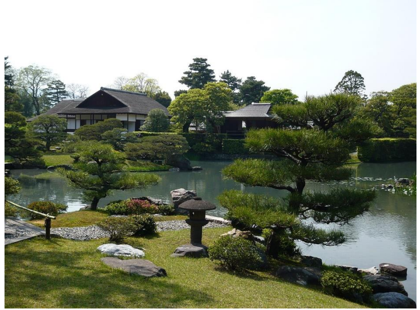
The gardens at Katsura Rikyu

Naturally, we would want to see places, buildings and institutions that are most characteristic of the life of Japan. We have spoken to friends here who have been to Japan, and they recommend not only Kyoto and Nara, but also Osaka (in particular, Bunraku), Nikko, Hakone, and of course the shrines and gardens (particularly the women's garden, Rjnku<sup>23</sup> – I hope I have spelt this correctly – near Kyoto).