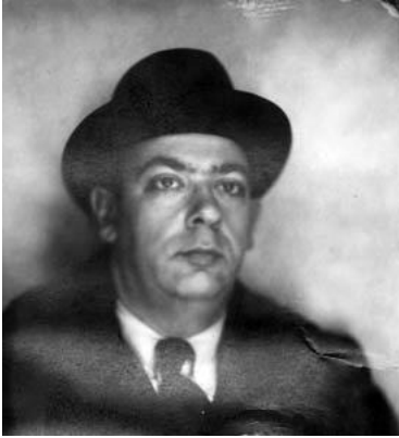
Possibly the photo referred to

On 12 January 1944 William Hayter, then a British diplomat in Washington, wrote to the Eastern Department of the Foreign Office in these terms: